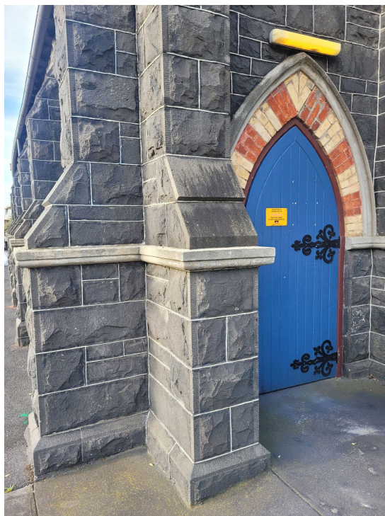
Left image is the pathway to the entry.