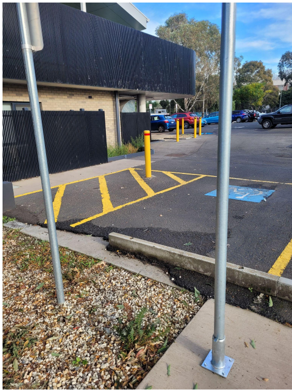
Image of accessible car park with transfer space

There is an accessible park located next to a ramp at the front of the car park.