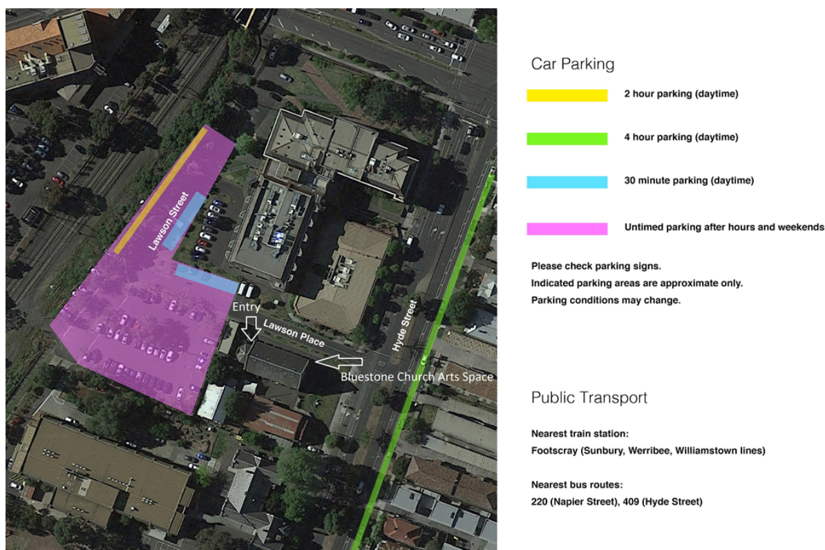
Image is a graphic of parking and entry at the venue. Relevant information is detailed below.

The Bluestone Church Arts Space is located at 8a Hyde Street, Footscray VIC