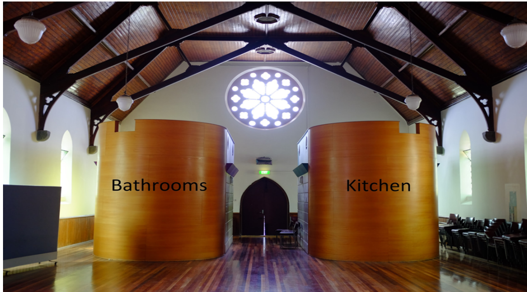
Image of the hall from the entry. Left is labeled bathrooms, the right is labeled kitchen.